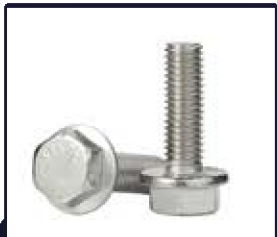
Hex Flange Bolts