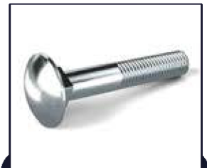
Mushroom Head Screw