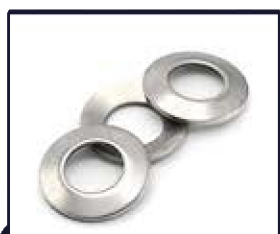
Conical Spring Washers