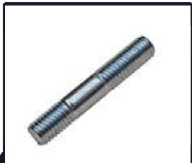
Double End Studs