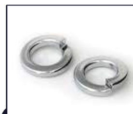
Spring Lock Washer