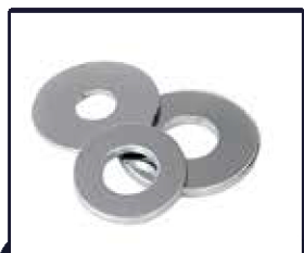
Plain Flat Washer