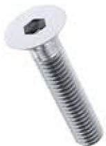
Counter Sunk Bolts