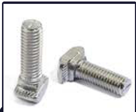
Hammer Head Screw