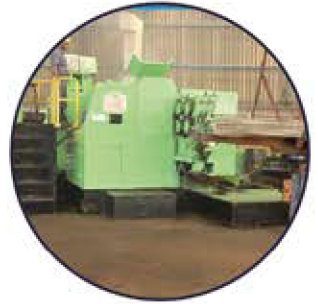
HOT & COLD FORGING