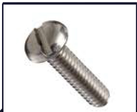
Pan Head Screw