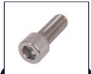
Socket Head Bolts