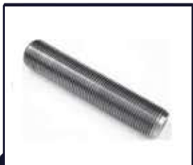
Full Thread Stud