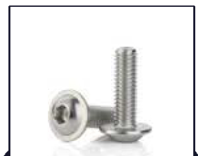
Button Head Screw