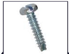
Thread Cutting Screw