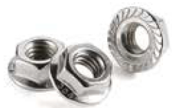
Hex Flange Nuts