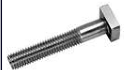
Square Head Bolts